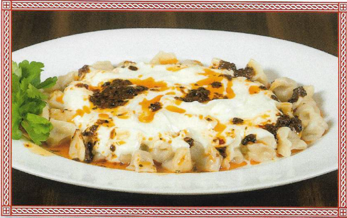
Manti (Turkse ravioli)